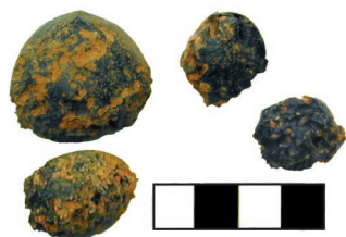
Fig. 2. Tektites from T4. Scale bar is divided into 1-cm units.

which tektites commonly are associated with younger sediments. In response, we note that at Bose, Paleolithic stone tools and tektites were observed to occur exclusively in T4, were found in excavation, and, thus, are in situ. The apparent absence of either tools or tektites in the three terraces that formed after T4 argues