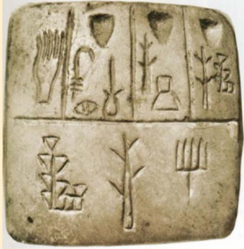
(Kis, Kr.e.3500 körüli agyagtábla .)