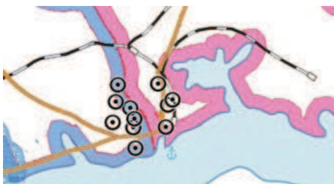
Figure Nampho-III. 1955 – 11 dong in Old-Nampho

In 1955 out of the 36 dong that existed in 2002, eleven dong are located in today's municipal area of Nampho, of which seven are in the former Waudo-kuyok (in the West) and four in the former Hanggu-kuyok (in the East).