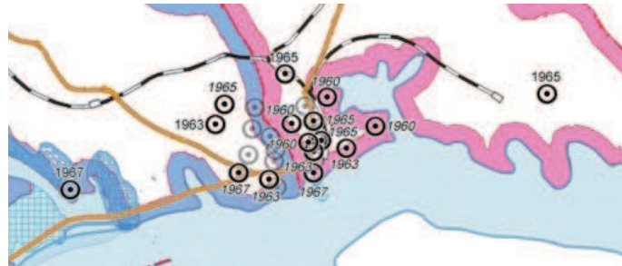
Figure Nampho-IV. 1960s-16 new dong in Old-Nampho

In the 1960s, between 1960 and 1967, 16 new dong were added, twelve of them by splittings from already existing dong . Five new dong originated in the western Waudo, eleven in the eastern Hanggu.