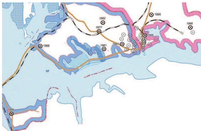
Figure Nampho-V. New dong in Old-Nampho after 1967

After 1967, only nine new dong were established in Nampho, three of them between 1977 and 1988. In the 24 years between 1968 and 1992 thus only three new dong were established within today's municipal border of Nampho. Only in the 1990's there was a stimulation. Six dong were established between 1993 and 1999.