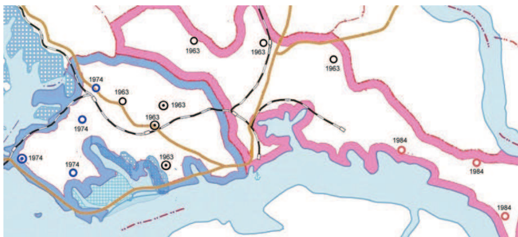
Figure Nampho-II. Old-Nampho – incorporations

been expanded five times since 1950. In 1963, two ri from the Onchon-kun and three ri from Ryonggang-kun, in 1974 another three ri from Onchon-kun and in 1984 another three ri from Ryonggang-kun were incorporated. Then, in 1988, one ri from Unryul-kun (Hwangnam Province) was added to the municipal area and in 1996 the Chodo island, which previously was a ri of Kwail-kun (Hwangnam Province), was incorporated.