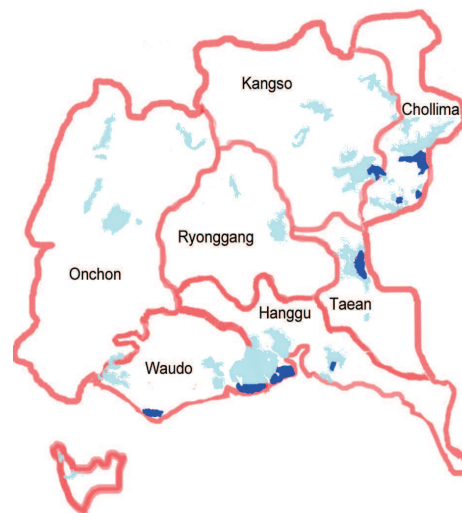
Figure Nampho-I. Urbanised areas (light-blue) and industrial areas (dark blue); (Source Yi Sang-jun et.al. 2011, 52)

Nampho is expected to develop into the largest industrial region in the west of the DPR Korea, with a concentration to be made on heavy industry (iron production, smelting plants, machine construction, building material production) (Kim Wŏn 1998, 245).