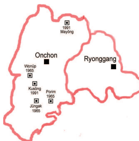
Figure Nampho-VIII. Up and rodongjagu in Ryonggang-kun and Onchon-kun

Ryonggang-kun was originally part of the Phyongnam Province. In 1979 it became part of the province-independent city of Nampho, then in 2004 it was again part of Phyongnam, in 2011 again part of Nampho. In 1952 the kun consisted of one up and 20 ri . In the course of time Ryonggang-kun has been reduced several times: in 1963 three ri were added to Nampho, in 1978 the Taeon-rodongjagu, which emerged in 1957 from Taeon-ri, as well as the Taejöng-ri, parts of Söngam-ri and parts of Ripsöng-ri were added to the newly founded Taeon-ri. In 1984 three ri were added to the Taeon-kuyok and