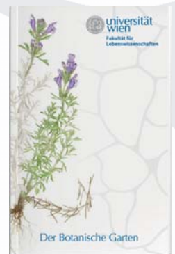
Cover of the guidebook to the Botanical garden, published in April 2015