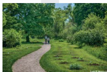
The Endlicher-Fenzl-Kerner-path is realized as a permanent installation in the systematic group. This interdisciplinary project deals with different aspects of the garden's history