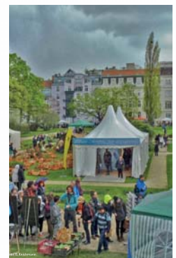
The University of Vienna presents an exhibition at the rare plants market in the Botanical Garden, April 2015

Besides this, the activities at the Botanical Garden within the anniversary year will mark the start and/or (hopefully) the realization of a number of further garden-related projects. Thus historical heritage will be used to trigger modern developments.