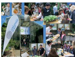
The “Fascination of Plants Day” was an attraction for the public and strengthened the relationship between the Botanical Garden and scientists of different institutions